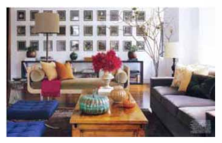
Our work can be seen in ELLE DECOR Magazine.